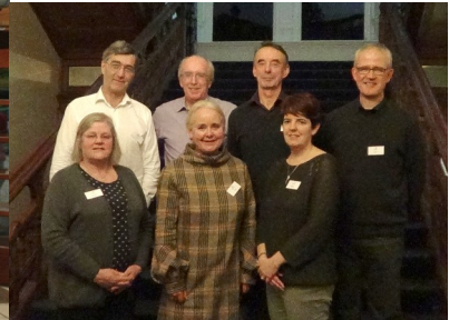
The FEL Team—Past and Present