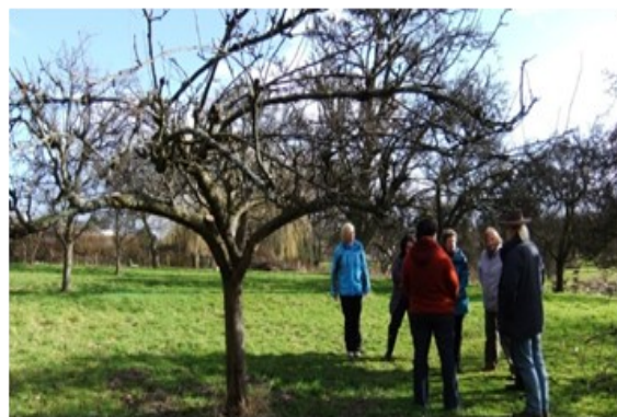
Orchard Biodiversity workshop in Blairlogie