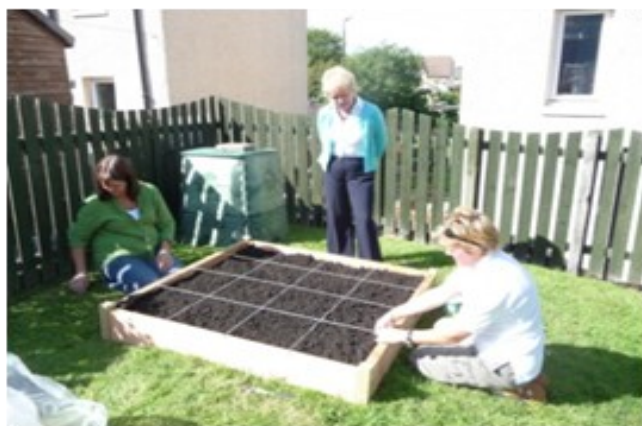
Square Foot Gardening at the Braes Family Centre, Maddiston, Falkirk