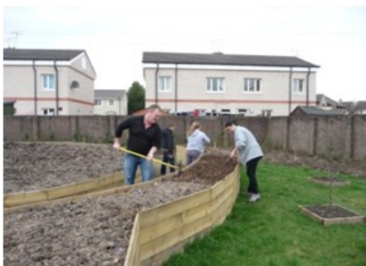
Filling the raised beds