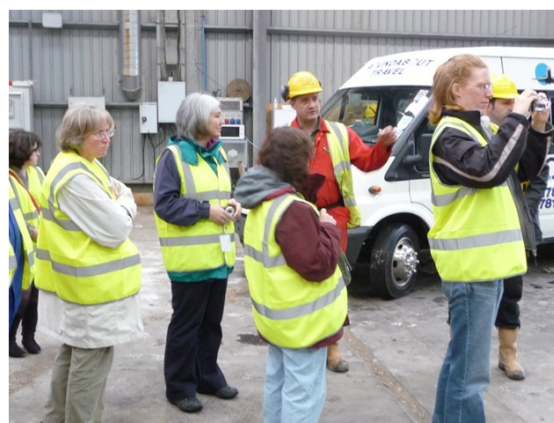
Trip to Levenseat Organics Ltd, a family run waste management plant near Forth in West Lothian.

The breakdown of grant funding for this year is as follows: