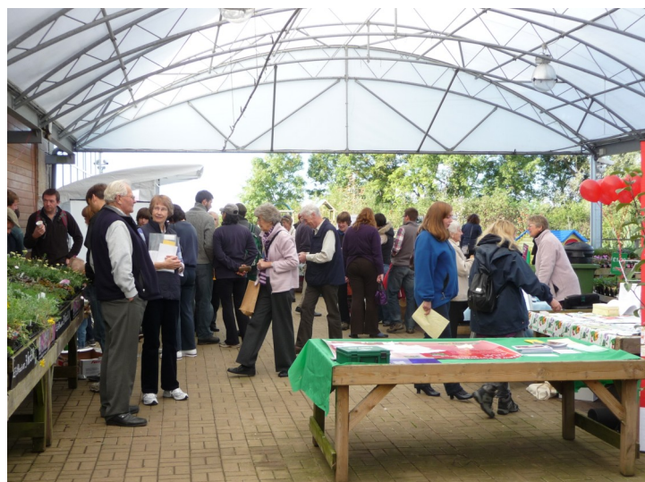
Forth Valley Orchard Day 2010