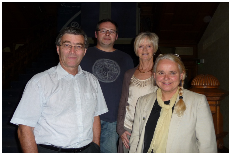
Forth Environment Link Board