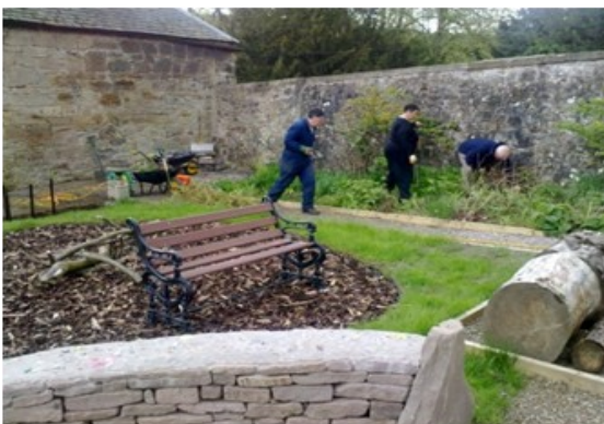
The gardening team weeding the borders