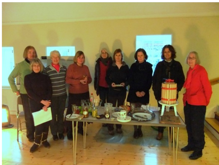
Fruit Harvesting Workshop