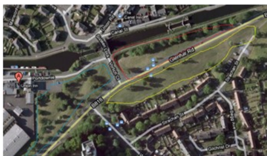
Potential community growing area, Falkirk