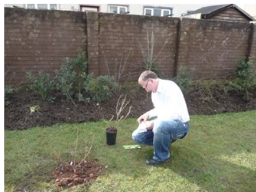
Community tree planting