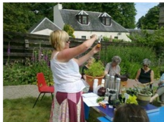
Workshop on Plants With Purpose