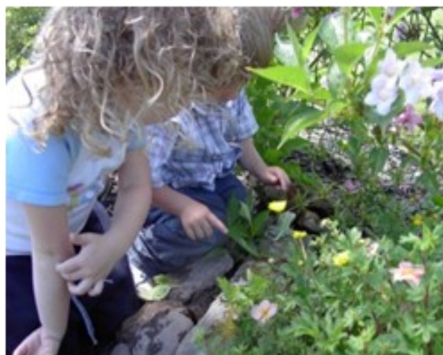
Pupils enjoying the wildflowers in Fallin Primary School