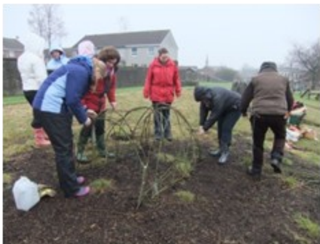
Weaving a willow sculpture in a CPD 'Twilight' session, Bannockburn Primary School