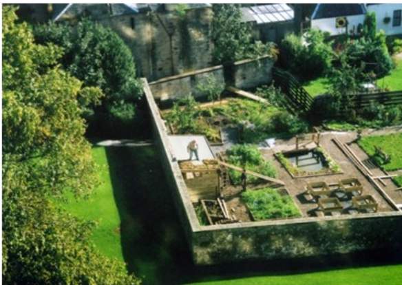
View from the High Flats