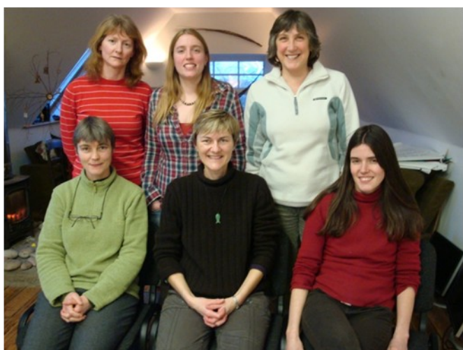
Staff at retreat