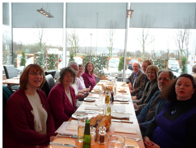
Volunteers at appreciation event

Our work would not be possible without the significant contribution made by our volunteers— THANK YOU!